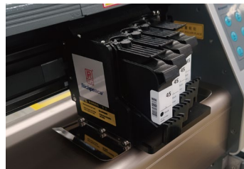
2 / 4 Ink Cartridge Printing