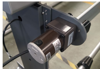
Collecting And Feeding Motor